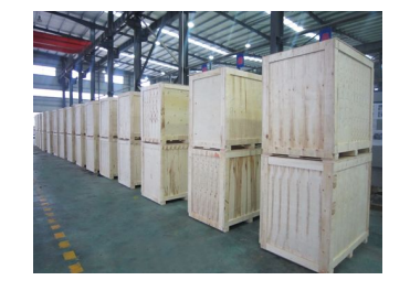
Every Generator Comes Well Packed